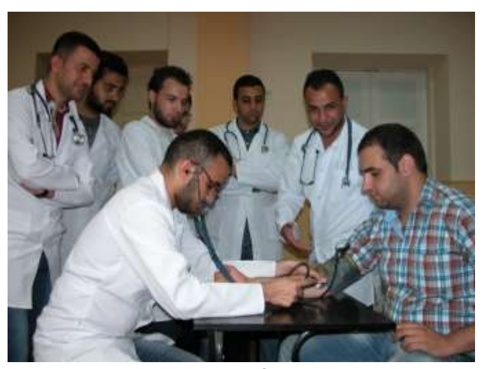
Clinical examination of the patient at the Department of Internal Medicine

medicine are part of numerous creative associations and groups of amateur performances, annually mass culturally entertaining actions are held.