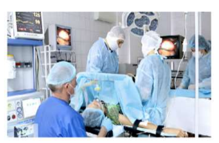
Practical training at the Department of Obstetrics and Gynecology

High quality of higher medical education is reached by means of combination of classical university approaches and innovative technologies. Leading specialists in their branches conduct teaching activity at the School of Medicine, among them there are more than 40 professors, doctors of medical sciences, and 180 associate professors, candidates of medical sciences, honored doctors and scientists and technicians of Ukraine, winners of state and international awards. Average experience in teaching activity of pedagogical staff of the Schools over 12 years. Teaching process of all disciplines is held according to the demands of Bologna Process and the level of the methodical support of disciplines is equal to 100%. All scientifically pedagogical employees annually pass numerous advanced training courses which allows to maintain a quality of education on the highest level.