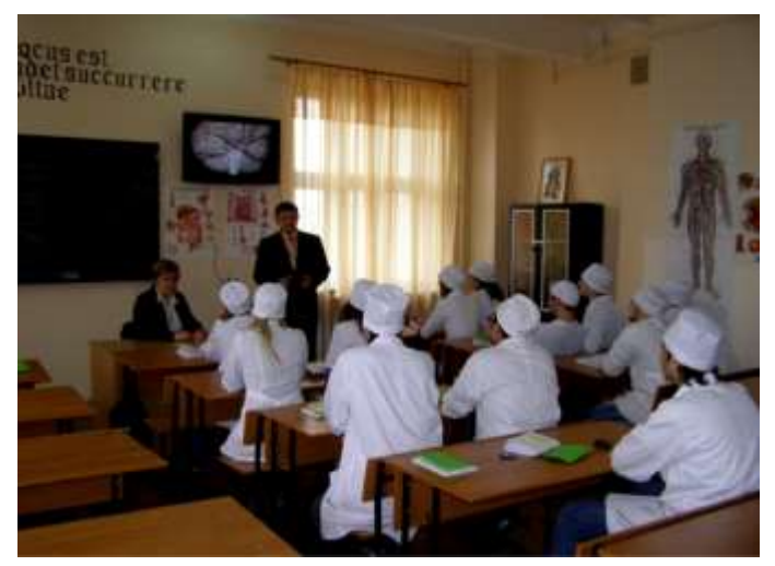
The work of the student scientific circle of the Department of General and Clinical Pathology

international actions for students and young scientists.